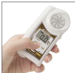
Press the START key.