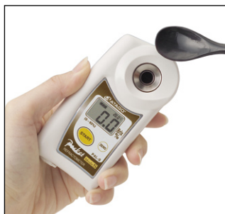
Place a sample on the prism.