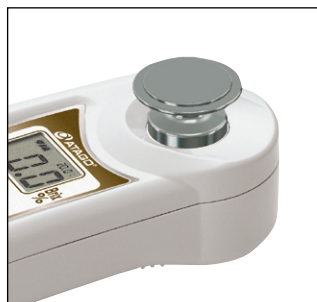
Put the provided MAGIC™ on top.