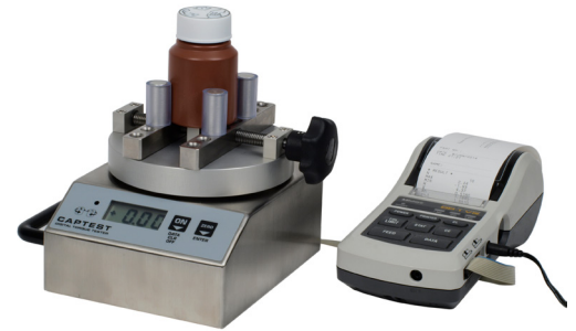
CAPTEST with Mitutoyo statistical printer

The CAPTEST can be operated in continuous-reading mode, or to capture peak torque values.