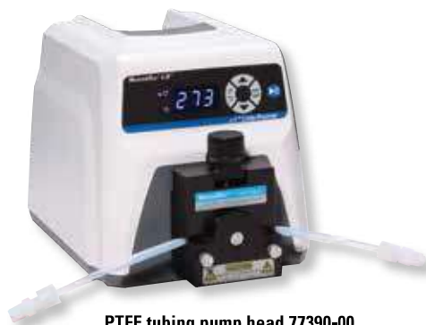
PTFE tubing pump head 77390-00 shown on L/S variable-speed console drive 07528-20 is ideal for transferring aggressive organic solvents.