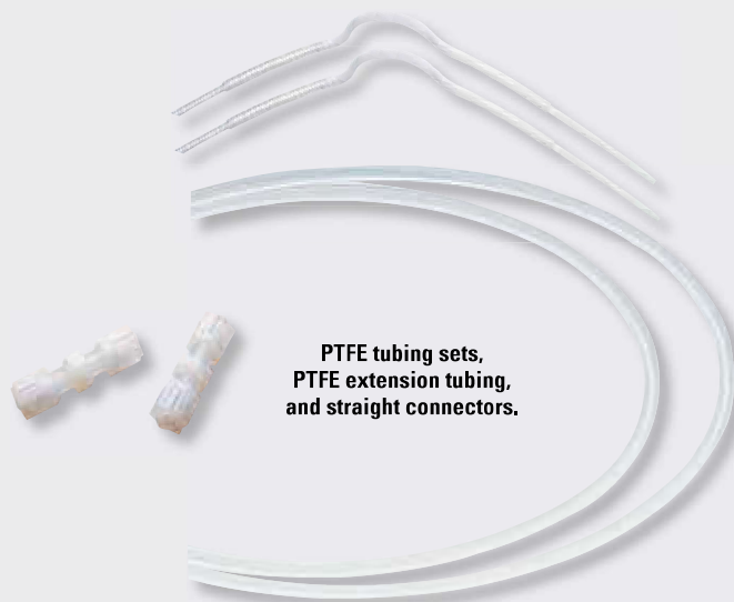
PTFE tubing sets, PTFE extension tubing, and straight connectors.

HL-31321-49 Tubing grooving tool. Use when connections must withstand 40 psi (2.8 bar) or greater