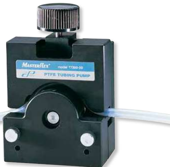
PTFE-tubing pump head 77390-00