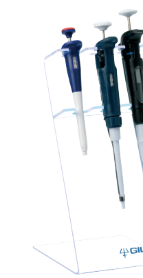
TRIO™ pipette holder (Ref. F161405)