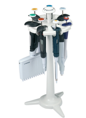
CARROUSEL™ pipette holder (Ref. F161401)

Good Laboratory Practice (GLP) features ensure the high quality and reliability of your work.