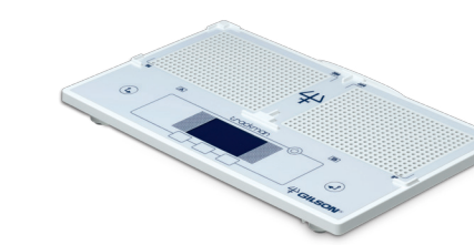
TRACKMAN™ (Ref. F70301)