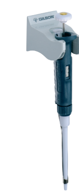
SINGLE™ pipette holder (Ref. F161406)